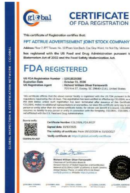
Certificate of FDA Registration FPT AdTrue