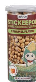
StickeePop Caramel Flavor

Ingredients: ancient sticky corn, organic cane sugar, coconut meat, pure matcha powder, salt