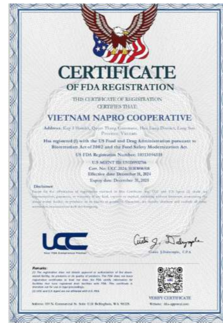
Certificate of FDA Registration Vietnam Napro