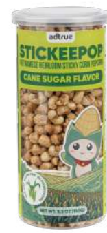
StickeePop Cane Sugar Flavor

Ingredients: ancient sticky corn, coconut meat, organic cane sugar, salt